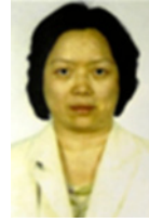
Cheng Chui Ping, convicted alien smuggler

Asia/Pacific: TOC networks and DTOs are integrating their activities in the Asia/Pacific region. Due to the region's global economic ties, these criminal activities have serious implications worldwide. The economic importance of the region also heightens the threat posed to intellectual property rights, as a large portion of intellectual property theft originates from China and Southeast Asia. Human trafficking and smuggling remain significant concerns in the Asia/Pacific region, as demonstrated by the case of convicted alien smuggler Cheng Chui Ping, who smuggled more than 1,000 aliens into the United States during the course of her criminal career, sometimes hundreds at a time. TOC networks in the region are also active in the illegal drug trade, trafficking precursor chemicals for use in illicit drug production. North Korean government entities have likely maintained ties with established crime networks, including those that produce counterfeit U.S. currency, threatening the global integrity of the U.S. dollar. It is unclear whether these links persist. The United States will continue to improve its understanding of the TOC threats in the Asia/Pacific region and will work with partner nations to develop a comprehensive response.