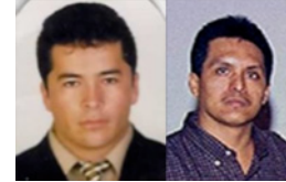
Mexico Los Zetas Cartel Leaders Heriberto Lazcano-Lazcano and Miguel Angel Treviño Morales

Western Hemisphere: TOC networks—including transnational gangs—have expanded and matured, threatening the security of citizens and the stability of governments throughout the region, with direct security implications for the United States. Central America is a key area of converging threats where illicit trafficking in drugs, people, and weapons—as well as other revenue streams—fuel increased instability. Transnational crime and its accompanying violence are threatening the prosperity of some Central American states and can cost up to eight percent of their gross domestic product, according to the World Bank. The Government of Mexico is waging an historic campaign against transnational criminal organizations, many of which are expanding beyond drug trafficking into human smuggling and trafficking, weapons smuggling, bulk cash smuggling, extortion, and kidnapping for ransom. TOC in Mexico makes the U.S. border more vulnerable because it creates and maintains illicit corridors for border crossings that can be employed by other secondary criminal or terrorist actors or organizations. Farther south, Colombia has achieved remarkable success in reducing cocaine production and countering illegal armed groups, such as the FARC, that engage in TOC. Yet, with the decline of these organizations, new groups are emerging such as criminal bands known in Spanish as Bandas Criminales , or Bacrim s.