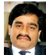
INTERPOL Fugitive Dawood Ibrahim, South Asia "Company D"

Afghanistan/Southwest Asia: Nowhere is the convergence of transnational threats more apparent than in Afghanistan and Southwest Asia. The Taliban and other drug-funded terrorist groups threaten the efforts of the Islamic Republic of Afghanistan, the United States, and other international partners to build a peaceful and democratic future for that nation. The insurgency is seen in some areas of Afghanistan as criminally driven—as opposed to ideologically motivated—and in some areas, according to local Afghan officials and U.S. estimates, drug traffickers and the Taliban are becoming indistinguishable. In other instances, ideologically