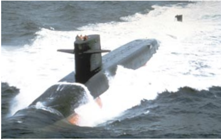
Each leg of the Triad brings a unique set of characteristics to be integrated with the other two, thus forming an effective strategic force.

important is consideration of the effect of enemy defense capabilities and limitations.