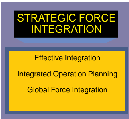
Figure III-1. Strategic Force Integration