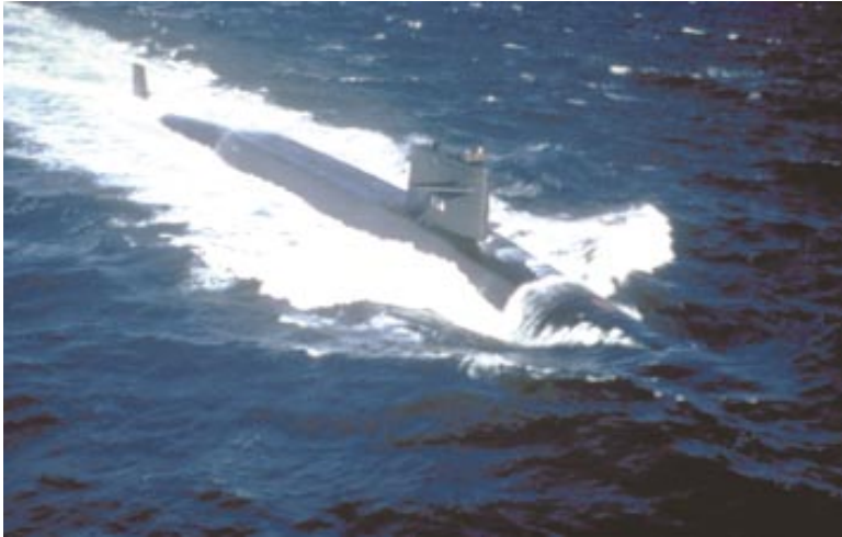
Sea-launched ballistic missiles deter potential aggressors from initiating an attack and remain deployed and ready should deterrence fail.

b. Strategy. Credible and capable nuclear forces are essential for national security. During World War II, nuclear weapons were instrumental in ending the war on terms favorable to the allies. The US postwar strategy has been one of deterrence, and nuclear forces have been developed,