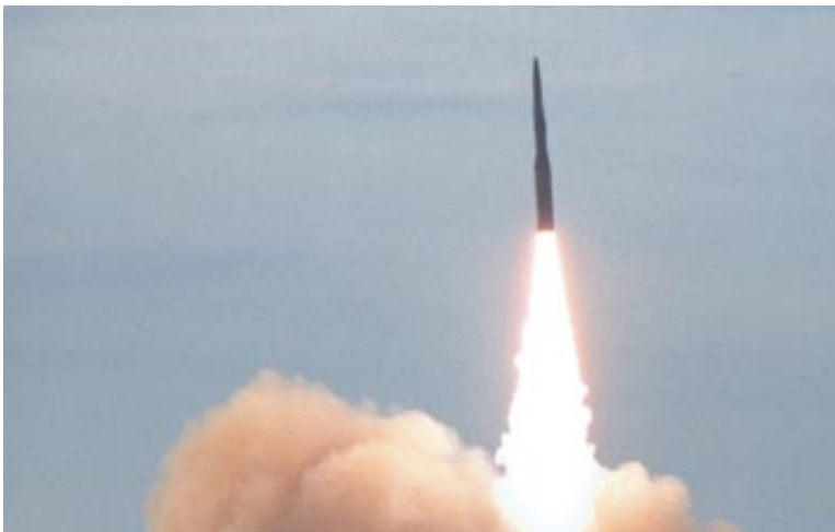
Intercontinental ballistic missile systems are able to strike quickly once the decision to employ nuclear weapons has been made.