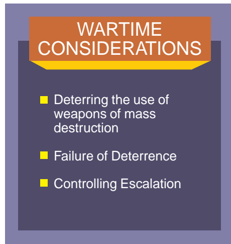
Figure I-2. Wartime Considerations