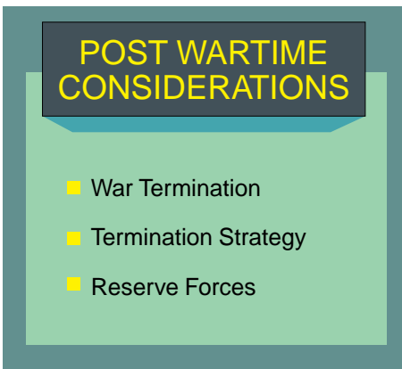
Figure I-3. Post Wartime Considerations