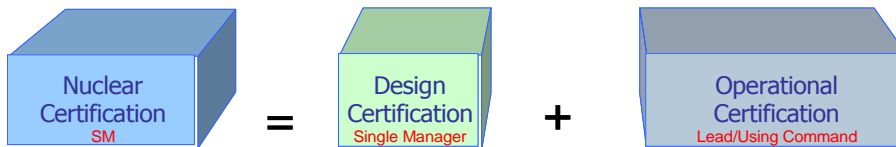
Figure 1.1. Nuclear Certification Major Components.

1.2.1. The Air Armament Center's Nuclear Weapons Directorate (AAC/NW) / Certification Management Division (AAC/NWC) grants nuclear certification when the system is design certified and at least one operational unit is Operationally Certified. The SM is responsible for obtaining and maintaining Design Certification for nuclear weapon capable systems in accordance with requirements identified in this AFI. The Lead/Using Command is responsible for obtaining and maintaining a unit's Operational Certification in accordance with this AFI.