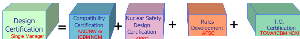
Figure 1.2. Design Certification Components.

1.2.2. Design Certification occurs when each of four components, as illustrated in Figure 1.2 , is accomplished for the weapon system: